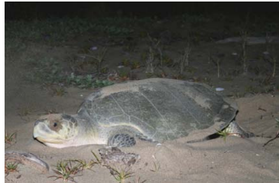
1b. Nesting female at Mapoon, Queensland.