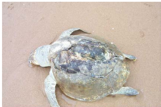
5c. Adult female L. olivacea (K34155) killed by boat strike and beach-washed at Moore Park, eastern Queensland, January 2000.