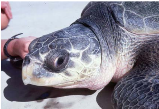
1c. Head of adult female, caught foraging off Townsville, Queensland.