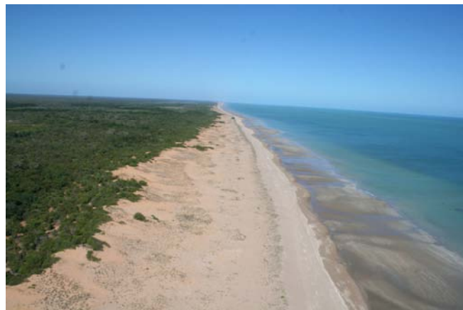
4b. Flinders Beach north of Pennyfather River, western Cape York Peninsula.

Figure 4. Lepidochelys olivacea nesting habitat in northern Australia.