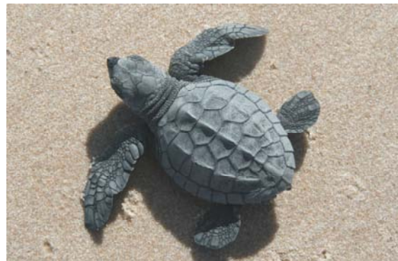
1d. Hatchling from Tiwi Island, Northern Territory.