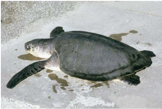
1a. Large immature from Cairns inlet, Queensland

Lepidochelys olivacea is one of two extant species for the genus (Figure 1), the other being Lepidochelys kempii . There are no valid subspecies currently recognised for L. olivacea (Pritchard and Trebbau, 1984).