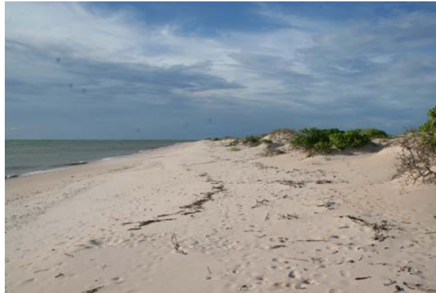
4a. Imula Beach, Melville Island, Northern Territory.

No census has been made of the size of the nesting population in Queensland. No Queensland rookeries are managed within National Parks or similar protected habitat.