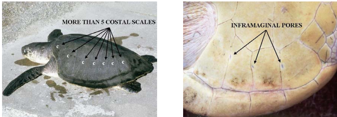
Figure 3. Diagnostic features for identifying Lepidochelys olivacea .

The carapace is covered with large keratinised scutes including six or more pairs of costal scutes. The presence of more than 5 costal scutes and inframarginal pores is diagnostic for the species (Cogger, 1992; Limpus, 1992) (Figure 3).