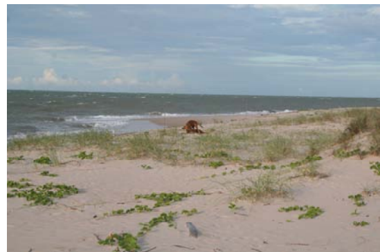
5d. Dingos preying on L. olivacea eggs, Imula Beach, Melville Island, Northern Territory.

Figure 5. Illustrations of a range of anthropogenic impacts on L. olivacea in northern Australia. Records from EPA Qld Marine Wildlife Stranding and Mortality database.