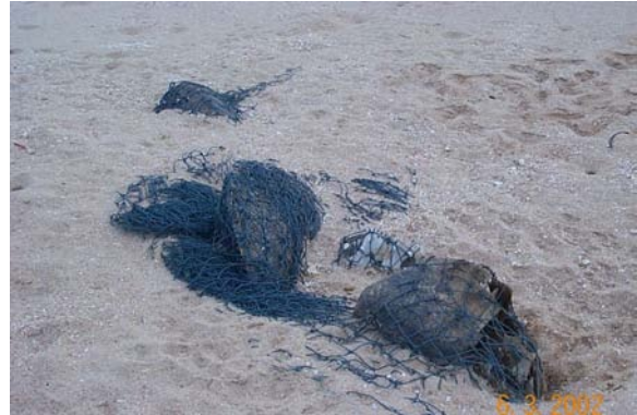
5b. Four large immature to adult-sized L. olivacea dead in a drift net beach-washed north of Duyfken Point, Weipa Queensland.