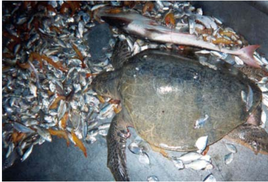
5a. Adult male L. olivacea among trawl bycatch, Northern Prawn Fishery, before Turtle Excluder Devices (TEDs).

Based on available data, it is not possible to quantify the present magnitude of cumulative mortality from the wide array anthropogenic sources impacting L. olivacea within Australia (Figure 5). Additional mortality from various sources including longline and gill net fisheries can also be expected to impact on for these turtle populations as they migrate within oceanic waters and adjacent waters in neighbouring countries.