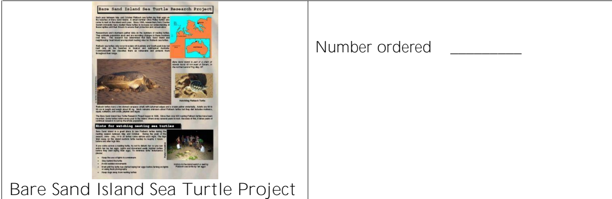
Bare Sand Island Sea Turtle Project